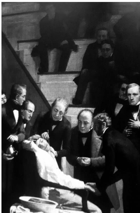
Figure 1. The first use of general anaesthesia with ether, October 16, 1846 [2]