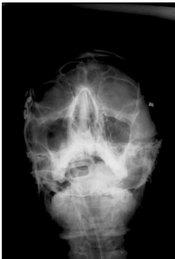
Figure 1. Head X-ray showing pellets in the skull

At the beginning of the hospitalization period the patient required administration of norepinephrine (2–4 µg min -1 ) and dopamine (2 µg kg -1 min -1 ) to maintain a mean ar-