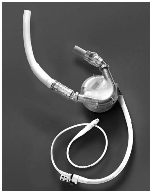
Fig. 1. Volume displacement pump –HeartMate Ryc. 1. Pompa membranowa – HeartMate