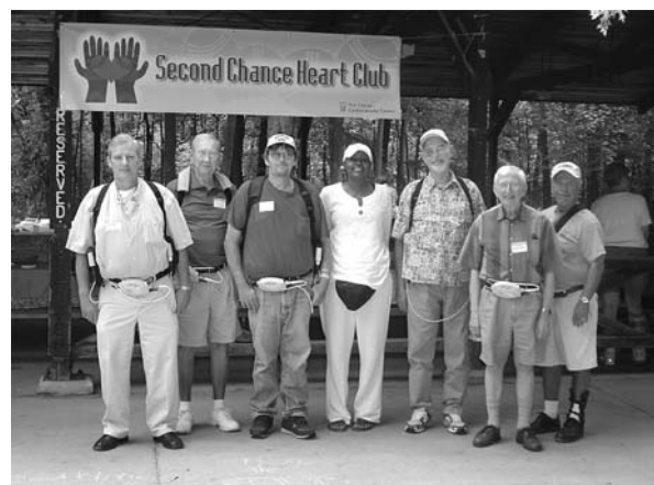
Fig. 3. VAD patients of Indiana University/Clarian Advanced Heart Care Program during their third “Second Chance Heart Club” reunion

Initial decision making regarding choice of VAD and implantation of VAD, management of postoperative complications and rehabilitation of patient with VAD only opens the door to the complexity of outpatient management of patient with VAD. Only well organized programs with 24/7 on-call support and dedicated team are able to provide fast response system to many issues associated with chronic VAD support. The reward is enormous and translates to good quality of life of supported patients and their families (fig. 3).