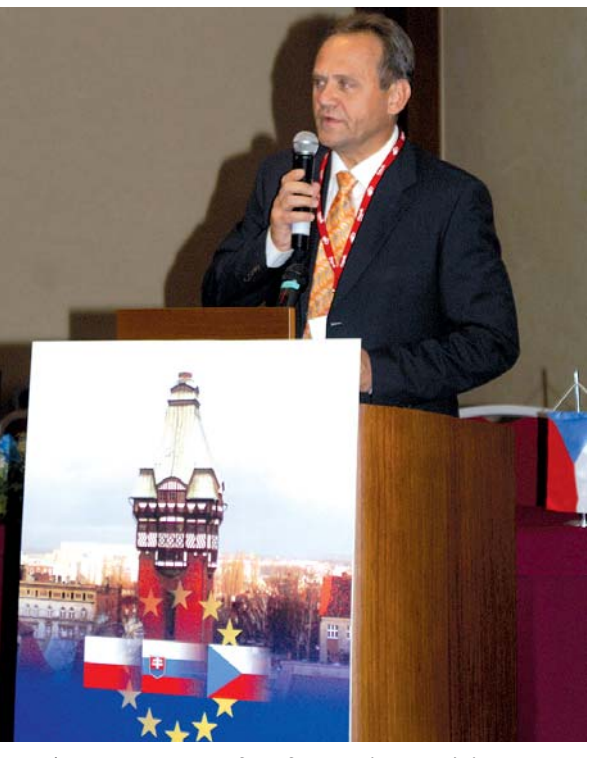
Figure 5. Lecture of Prof. Stanislav Czudek