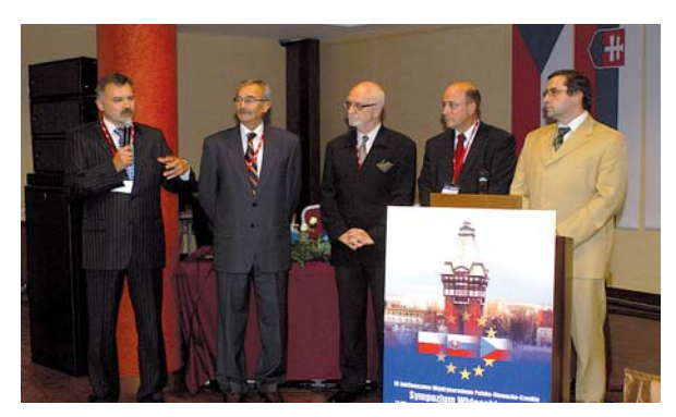
Figure 3. Opening Ceremony with participation of Presidents of Videosurgery organizations of Poland, Czech Republic and Slovakia and Organizing Committee