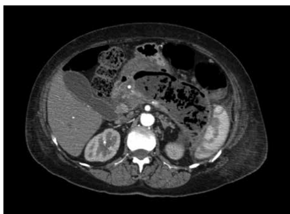
Figure 1. Computed tomography scan shows infected walled-off necrosis (WON) located within the lesser sac and extending anterior to the left kidney

The patient was rehospitalized 10 weeks later because of infected pancreatic necrosis. On admission, there was a tender mass in the left epigastrium. Laboratory investigations showed CRP of 239 mg/l. This time computed tomography revealed a walled-off necrosis (WON) with gas bubbles (Figure 1). The lesion was located in the lesser sac and extended through the left retrocolic region down to the pelvis. The patient underwent ultrasound-guided percutaneous catheter drainage of this fluid collection and a 32 Fr drain was inserted through the left retroperitoneal access situated between the descending colon and the left kidney. Purulent fluid with necrotic debris was drained. Culture of the fluid grew Escherichia coli , Bacteroides fragilis and Peptostreptococcus spp. Because of persistent local sepsis despite 2 weeks' percutaneous drainage, we decided to perform a percutaneous retroperitoneal pancreatic necrosectomy using a single-access port SILS (Covidien Poland). This is a special port made of a flexible soft foam with access channels for 3 trocars. This technique is fully described elsewhere [9]. In short, the lumbar incision was dilated and a single-access port was placed. The necrotic debris was removed piecemeal using grasping forceps under the visual guidance of a laparoscope. The postnecrotic