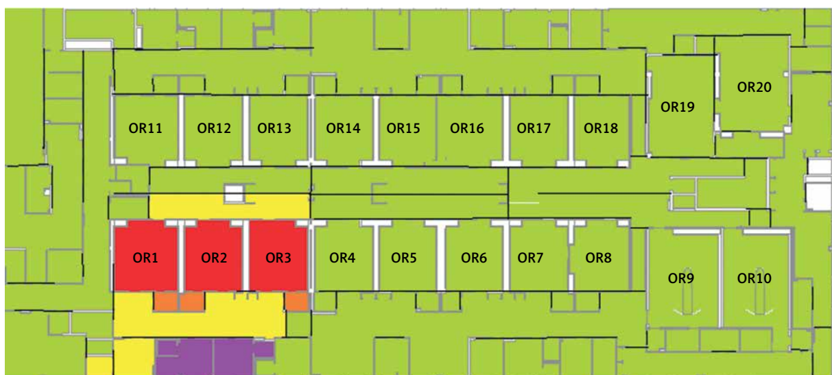
Figure 1. Operating department layout plan

The positive pressure environment in the operating suites continues in the COA because our operating rooms were designed in this manner. Laminar flow with positive pressure in the OR is in our opinion much safer than negative pressure, which is difficult to predict. There is a very common misconception that what makes a negative pressure room is a change in the pressure alone. However, negative and positive pressure rooms are designed in two different ways. The negative pressure room needs to be airtight to prevent an uncontrolled air entry, and it does not secure the sterility of the surgical field. The