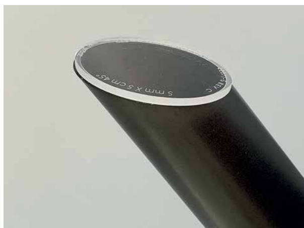
Fig. 2. Picture of tissue-equivalent polymethyl methacrylate (PMMA) bolus attached to IOERT applicator exit to move maximum dose to tissue surface

Surgery was categorized as follows: abdomino-perineal resection (APR), low-anterior resection (LAR), total exenteration (TE, including a resection of the rectum,