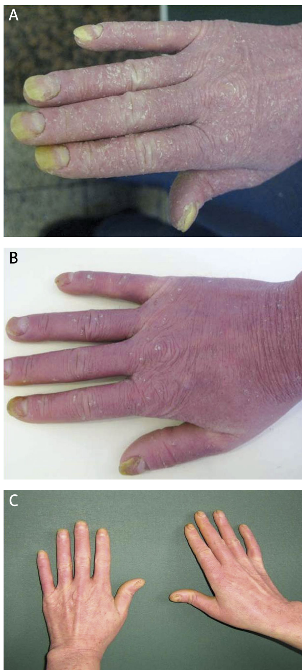
Fig. 1. Patient, 46 years old. A – Psoriatic lesions of the hands and fingernails before the therapy with etanercept. B – Improvement of psoriatic lesions of the hands and fingernails after 4 weeks of therapy with etanercept. C – Improvement of psoriatic lesions within hands and fingernails after 2 months of treatment

Case reports of patients who achieved significant skin improvement and even complete remission of psoriatic