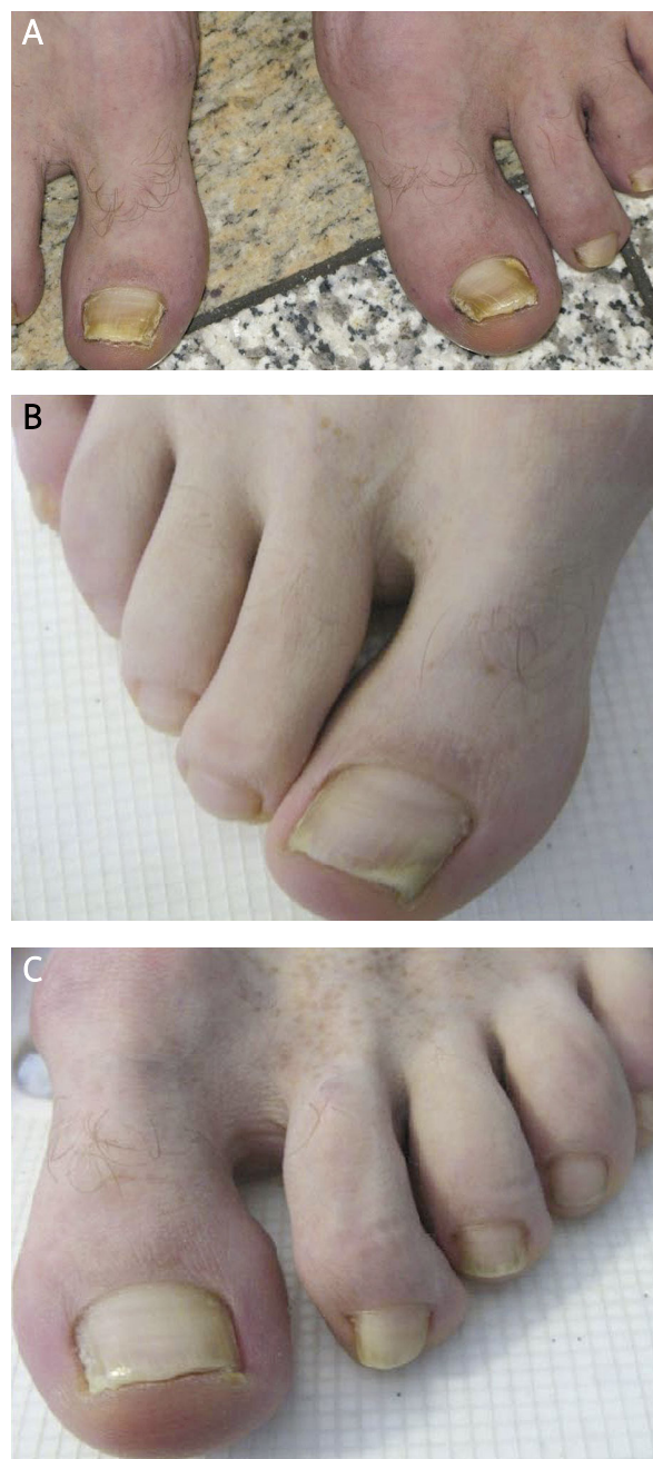
Fig. 2. Patient, 24 years old. A – Psoriatic lesions of toenails before treatment. B – Clinical improvement of psoriatic lesions within toenails after 12 weeks of treatment with the use of etanercept. C – Clinical improvement of psoriatic lesions within toenails after 12 weeks of treatment with the use of etanercept