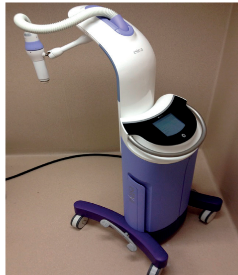
Figure 3. The Esteya Electronic Brachytherapy System (Nucletron, an Elekta company, Elekta AB, Stockholm, Sweden) [6]

Many published studies confirm the high percentages of the cure rate using skin cancer BT. Selected results are shown in Table 3.