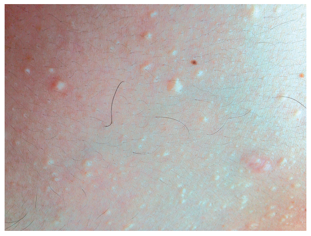
Figure 1. Multiple 1–5 mm-sized, flesh-coloured, firm, discrete papules on the upper chest

A 22-year-old man presented with asymptomatic, flesh-coloured papules on the trunk and upper arms. The lesions had first appeared when he was 13–14 years old and slowly progressed over years. He did not define antecedent trauma or local inflammation. He had acne vulgaris history and he had taken isotretinoin therapy for acne vulgaris 2 years before admission. While acne lesions regressed, the papules did not change as a result of this therapy. There were no other significant findings in his personal and family history. Dermatological examination revealed multiple 1–5 mm-sized, flesh-coloured,