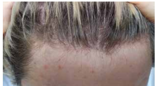
Figure 1. Frontal fibrosing alopecia: a classic linear pattern of hair loss