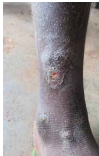
Figure 4. Multiple yaws lesions on the leg, 10-year-old Bantu boy; treatment: single dose of azithromycin 900 mg