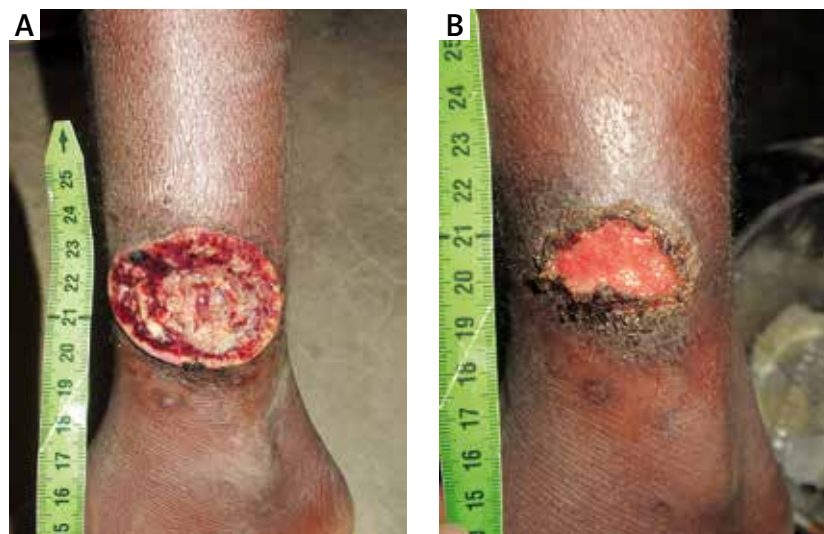
Figure 2. Yaws manifested by an ulcer on the leg, 9-year-old Pygmy boy (A) and 20 days after a single dose of treatment with 1.2 million IU of benzathine benzylpenicillin (B)

The study group involved 729 children, including 494 BaAka Pygmies and 235 Bantu. Their skin was examined for any yaws-specific lesions. A total of 191 Pygmies (38.7%) and 101 Bantu (43.0%) children presented characteristic yaws lesions. There was no statistically significant difference in the prevalence of yaws lesions between Pygmy and Bantu children. In the group involving Pygmy children (304 males, 190 females) skin lesions were more often found in boys than in girls (116 males vs. 75 females). A similar finding was observed in the group of Bantu children (127 males vs. 108 females) where boys with yaws lesions predominated over girls (58 males vs. 43 females). The mean age of all Pygmy and Bantu children participating in the study was 8.6 years and 9.1 years, respectively. The mean age of Pygmy children with yaws-specific lesions was 9.1 years and of those without skin lesions – 8.2 years, whereas the mean age of Bantu children with yaws lesions was 9.7 years, and those without skin lesions – 8.6 years. Skin lesions mainly affected the lower limbs (Figures 2–4), in particular the lower leg, the bridge of the foot, the heel and the knee (Table 1).