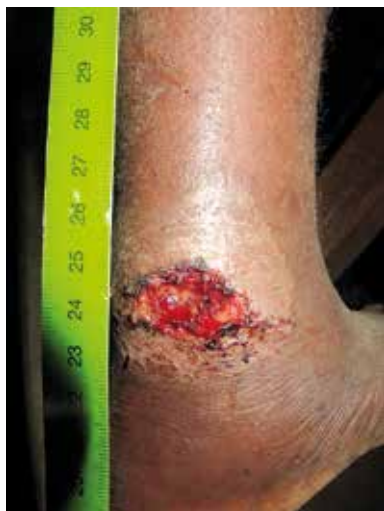
Figure 3. Yaws manifested by an ulcer on the leg, 8-year-Pygmy boy; treatment: single dose of benzathine benzylpenicillin 600,000 IU