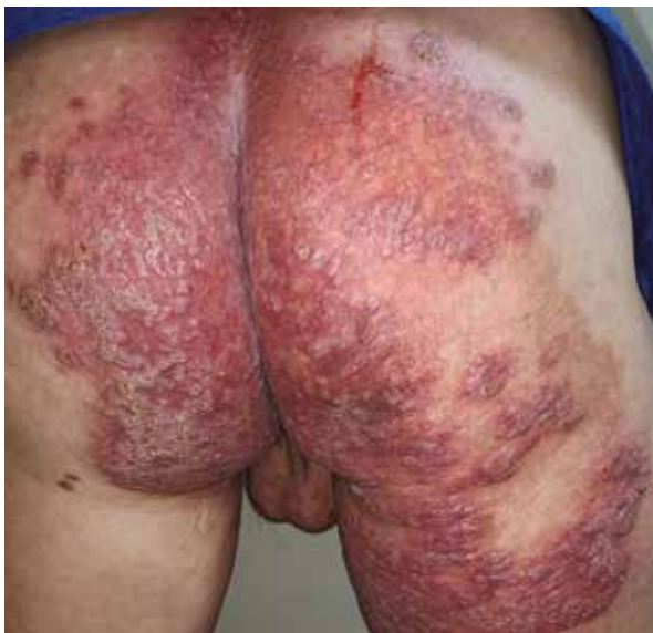
Figure 1. Clinical photos of the lesion from the patient. Multiple verrucous erythematous papules with large erythema and telangiectasia involving his perianal area, buttocks and right thigh

A 52-year-old Chinese builder had presented with pulmonary tuberculosis for more than two decades and asymptomatic painful erythema papules involving the buttocks for one decade. Two decades ago, he was diagnosed with tuberculosis because of haemoptysis, but his tuberculosis had not been treated systematically. A decade later, he had haemoptysis again and began to develop erythema papules on his right buttock and then they spread to the contralateral and perianal areas, but he did not seek any medical treatment. One year ago, the skin lesions deteriorated rapidly and the patient felt pruritus on them and there was purulent fluid after pressing them. There was no improvement