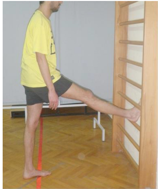
FIG. 1. Static stretching.

Subjects performed the hold-relax technique bilaterally as a self-stretch under the supervision of a physiotherapist. The technique consisted of an active SLR with dorsiflexed ankle and toes. The subject raised his legs by turning the heel towards the opposite shoulder while clasping the hands around the back of the thigh. Then the subject performed a hold contraction for 10 seconds and relaxed