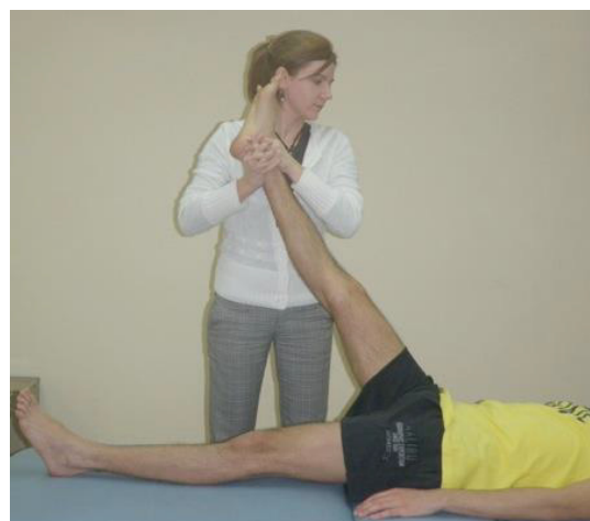
FIG. 3. Mulligan traction straight leg raise technique.